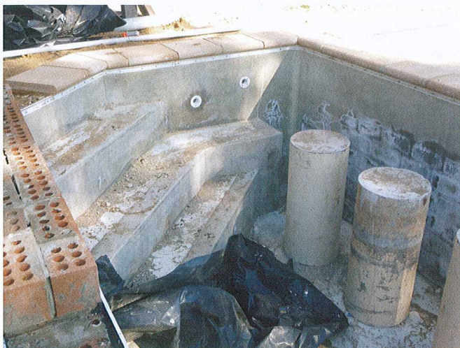
The concrete shell of the complex pool that is yet to be adorned with an Abgal custom-made liner

Because products leave Abgal in a cardboard box the team rarely gets to see the finished product. In this case the Perth-based pool company "just clipped it in... and it fitted just perfectly, which is just wonderful. The installer sent three images from his mobile phone as he was so impressed by the fitting, so we got to see it early on."