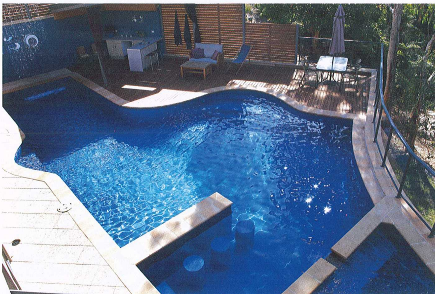
Non-standard shaped, free-form pools such as this are designed to suit individual backyards and landscapes, following the contours of the house and property line.

With all measurements carefully documented, the Abgal team carefully created a 3D model of the pool and then 'unfolded' the pool, the steps and the bar stools into 2D sections that could be cut from the liner fabric.